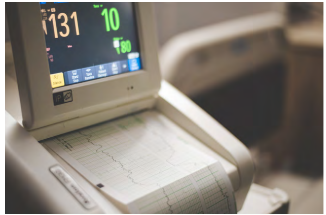
AI has the ability to analyze extensive datasets from millions of patients

immune function analysis. The multi-omics approach unveils a holistic understanding of an individual’s health. “This holistic profiling has yielded promising results, such as AI-driven dietary interventions to balance blood sugar levels,” Segal said. “The potential to reverse conditions like prediabetes opens the door to a future in which health care is truly individualized.”