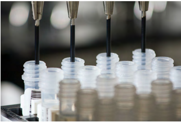
MBZUAI is pushing the boundaries of personalized medicine